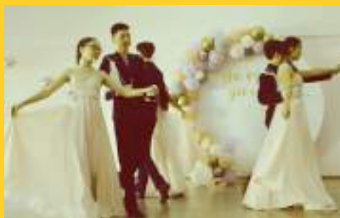
Students of Grade 9K congratulated the school and the teachers with a wonderful dance "Medley Historical Dances"