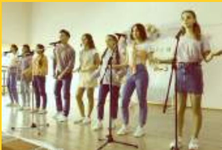
A gorgeous capella of the "Perekryostok" group of the active 8-11 graders.

After the lessons the teachers were invited to a marvelous concert where the children surprised their audience with excellent performance: they danced, sang amazing songs, staged deep and touching plays. The director awarded the best of the best with government diplomas. Then all the staff had a school after party with delicious meals, funny jokes and disco. Yes! They did have a disco :)